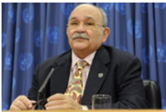
General Assembly President Miguel d'Escoto Brockmann

"Let's make sure the financial crisis does not divert our efforts. If we are to take away any lesson from the multiple crises we face, it is that delaying action only makes matters worse."