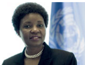
UN Deputy Secretary-General Asha-Rose Migiro

"Despite the recent announcement by the World Bank that considerable progress has been made in reducing poverty and hunger, our work to achieve the Millennium Development Goals is clearly at risk," she cautioned.