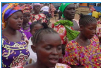
Women marching against sexual violence in the DRC