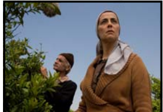
FILM: THE LEMON TREE

Synopsis: Salma, a Palestinian widow, has to stand up to her new