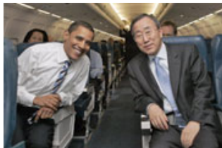
Secretary-General Ban Ki-moon with US Senator Barack Obama in February 2007