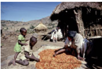
Current global crises demand decisive action

"We must... leave this conference with a sense of purpose and mission, knowing that we are allied in our determination to make a difference. Only by acting together, in partnership, can we overcome this crisis, today and for tomorrow. Hundreds of millions of the world's people expect no