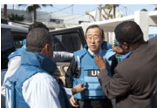
Secretary-General Ban Ki-moon gets first-hand look at Gaza devastation