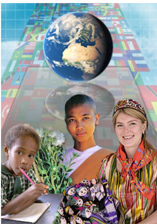
21 February: International Mother Language Day